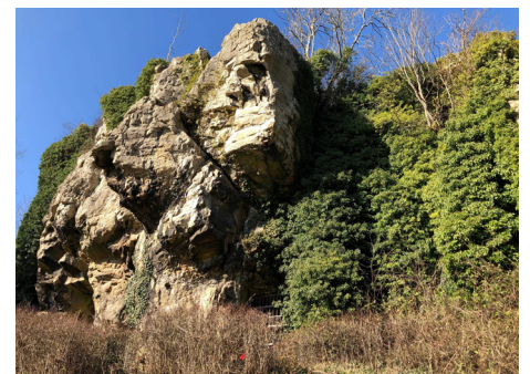
The breathtaking Creswell Crags

There are regular cave visits and the on site museum hosts many displays and exhibitions throughout the year, taking you on a natural history journey through time. A superb café with far reaching views, serving a variety of tasty treats and refreshments is also available.