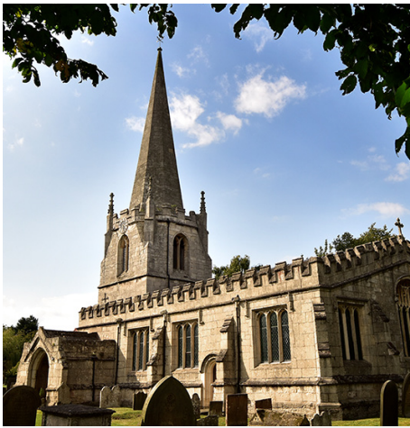
Parish church of St Wilfrid's, Scrooby