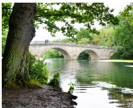
Clumber Park is well worth a visit

The Walled Kitchen Gardens are a pleasure; built in 1772 to supply the Dukes of Newcastle with vegetables and fruit, it is now home to the National Collection of apple varieties, including the new variety 'Pilgrim 400', and over 130 varieties of rhubarb! The 19th century glasshouses and palm house grow plants and produce all year around, offering glorious displays. Home grown produce is also used in the Garden Tea Room, where a variety of food and drinks are served. The beautiful lakeside provides stunning views and breath-taking walks. (Entry fees apply).