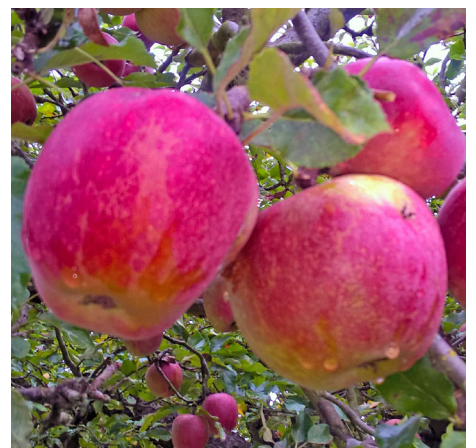
A great tribute to mark the occasion

A number of these exquisite trees are to be planted in various locations along key destinations of the Mayflower Pilgrim Trail and can be viewed on this tour.