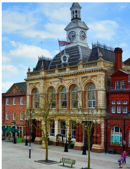
Retford Town Hall in the Market Square