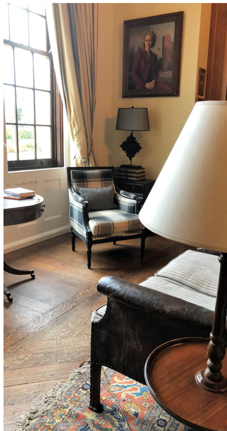
Enjoy a relaxing stay at Hodsock

Take a tour the house and hear a member of the family's historical stories about life in a stately home. Explore the stunning landscaped gardens with a guided photo tour. Enjoy delicious Afternoon Tea in one of the delightful rooms, or outdoors on the Italian Terrace overlooking the lake.