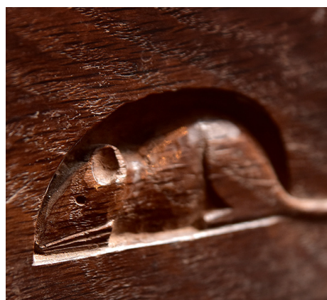
Find All Saints' famous mouse carvings

Listen to the story of how one young boy discovered the crypt where the Chalice and Bible were found, and view replicas of those historical findings. Search for the hidden Mayflower Mice, explore the beautiful woodland setting and walk along the Pilgrim Way.