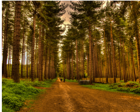
The Legendary Sherwood Forest

Sherwood Forest was once a Royal hunting ground which provided entertainment for Kings and nobility from across Europe. The forest has been a settlement since the last Ice age, and has seen countless changes through time, with many a tale to be told by the hundreds of giant oak trees which scatter the forest. Now a RSPB national nature reserve with almost 1,000 oak trees, the forest attracts visitors from all over the world, and the iconic Major Oak is worth visiting, let your imagination run wild! (Car parking fees apply).