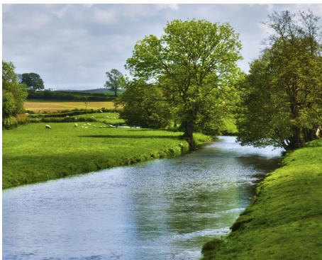
See the best of our wonderful county

Take a guided Mayflower Pilgrim Walk with successful Author and Photojournalist, Sally Outram. Follow in the footsteps of the Mayflower Pilgrims with a selection of circular walks which follow the Pilgrims Trail. The routes explore historic sites which are associated with the Pilgrims. Visit tranquil, quintessentially English villages, rivers and canals, see an abundance of wildlife, flora and fauna. (Additional cost applies). For more information and to book, please contact Sally Outram on 07986 011 903 or visit sallyomedia.com